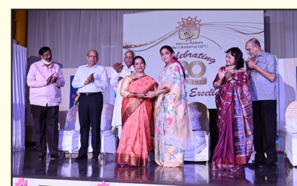
Felicitation of a Teacher for her dedicated service of 20 years