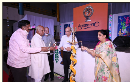
Lighting the Lamp by the Hon. Dignitaries